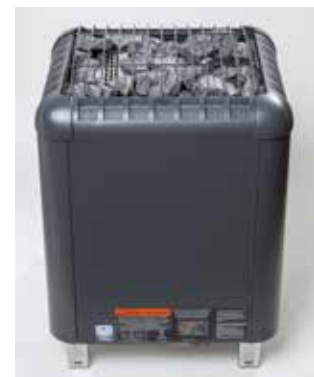
LAAVA & MAGMA WT Optional: auto-fill or manual fill