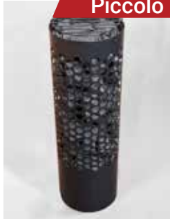
Flat wall mount