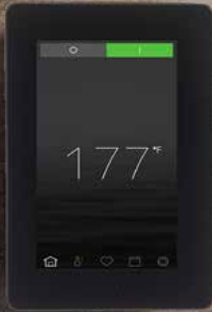
Elite Cloud Control shown with mobile phone app