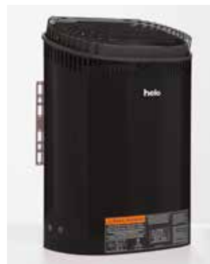
FONDA PURE WT Standard