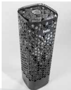
HIMALAYA WT Standard