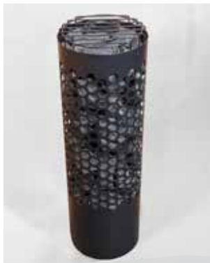
PICCOLO WT Standard