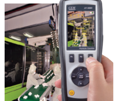
JPG images/AVI videos