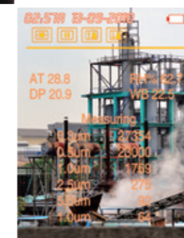
Fold reading on the images