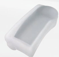
▲ PAL Silicone Cover

◀ Small Volume Sample Adapter for PAL Allows for measurements with a small volume of sample. Place directly on the sample stage.